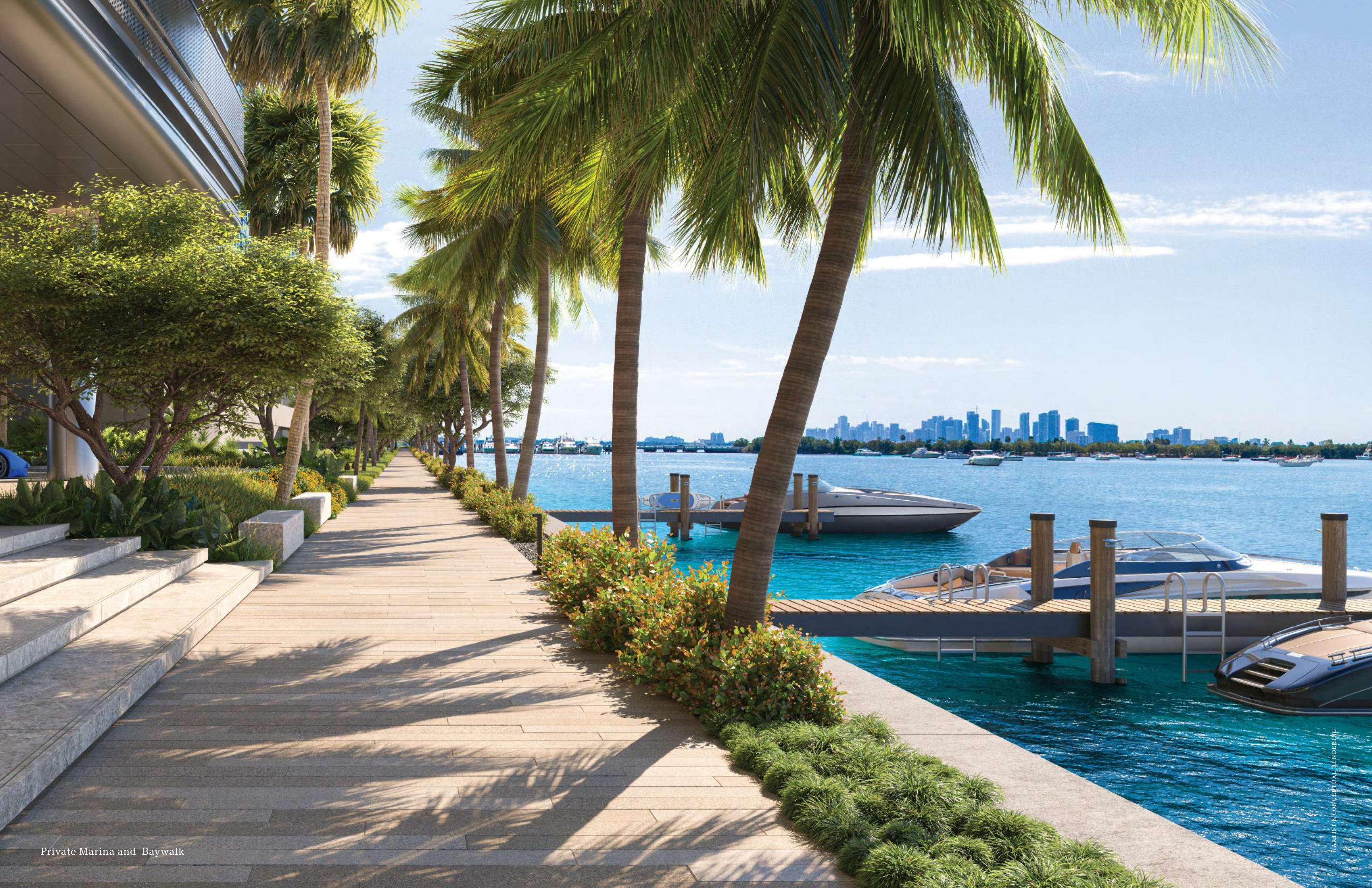
Private Marina and Baywalk